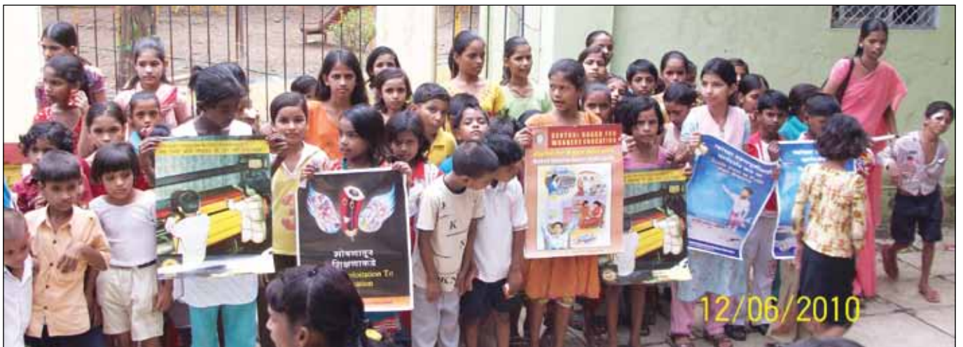
Awareness Programme was organised at Chembur area among the children rescued under Anti-child Labour Law