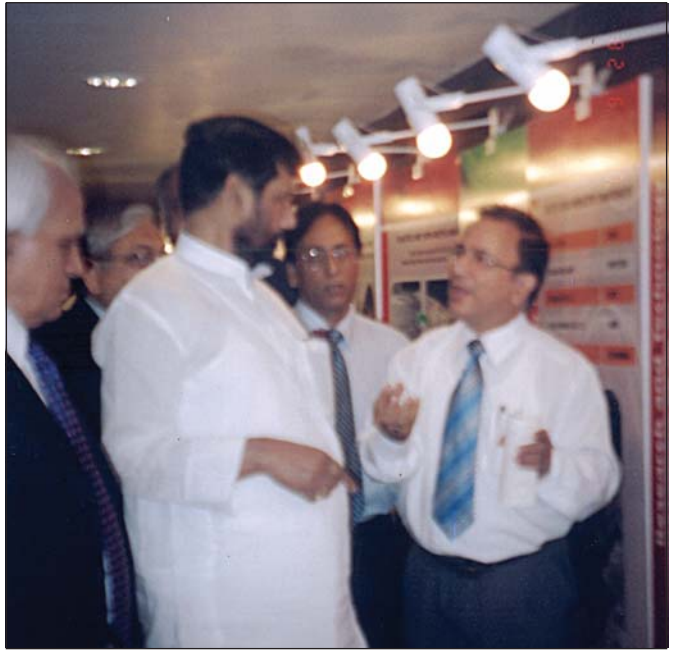
Hon'ble Minister seeking clarification on certain points from ICPE and Plastindia Team.

of such possibilities of manufacture of useful products from recycled plastics. The Hon'ble Minister also stressed that the industry should ensure that consumers get the cost benefit of recycled plastic products. This, he had said giving examples of the briefcase manufactured from battery waste. The Hon'ble Minister also answered questions from the press on various critical points on anti-plastics propaganda.