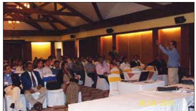
The Workshop in progress