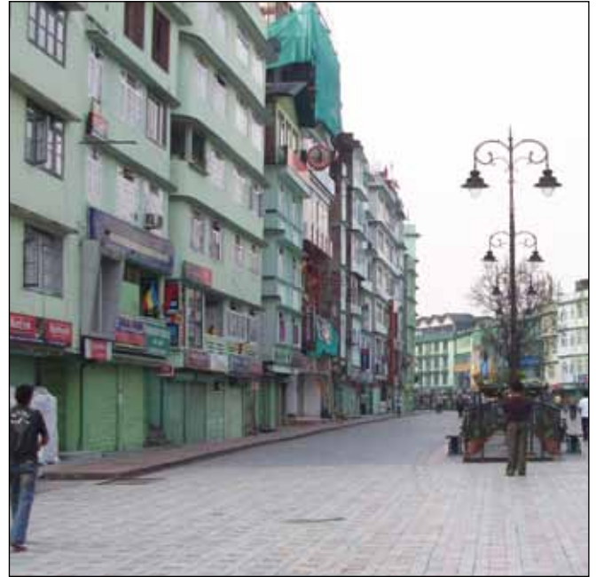
Clean road of Gangtok Sikkim