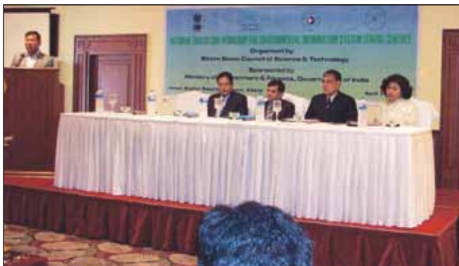
Inauguration of ENVIS Workshop