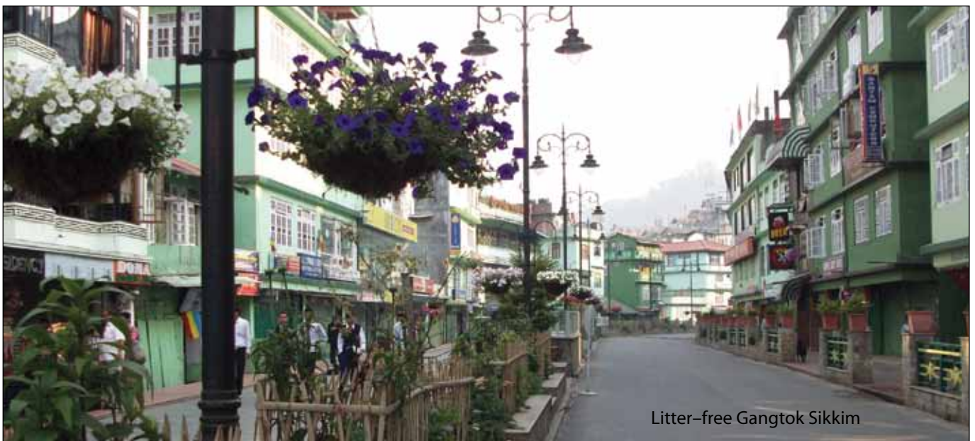
Litter-free Gangtok Sikkim