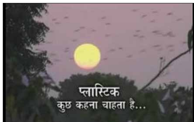
Listen Plastics have something to say in Hindi was released in May 2010

You can download the complete DVD from ICPE Website http://icpeenviis.nic.in/new-video.html http://icpeenviis.nic.in/new-videoH.html