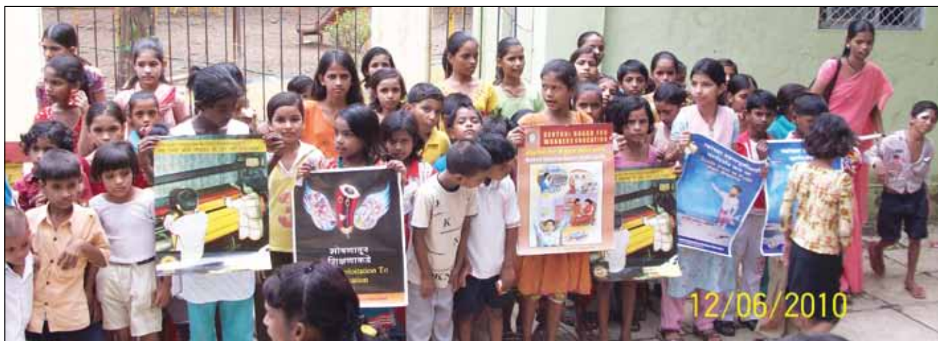
Awareness Programme was organised at Chembur area among the children rescued under Anti-child Labour Law