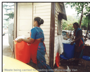
Waste being carried for loading into Municipality Van