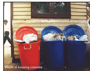
Waste at housing colonies