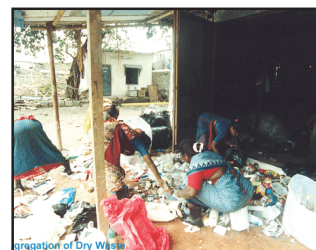
regation of Dry Waste