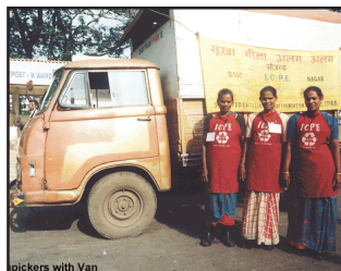
pickers with Van