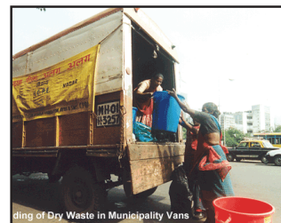
ding of Dry Waste in Municipality Vans