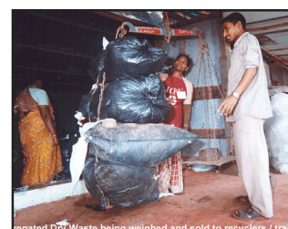
Segregated Dry Waste being weighed and sold to recyclers / traders