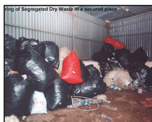
Storage of Segregated Dry Waste in a secured place