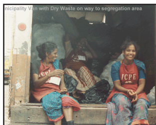
municipality Van with Dry Waste on way to segregation area