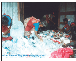
other view of Dry Waste segregation